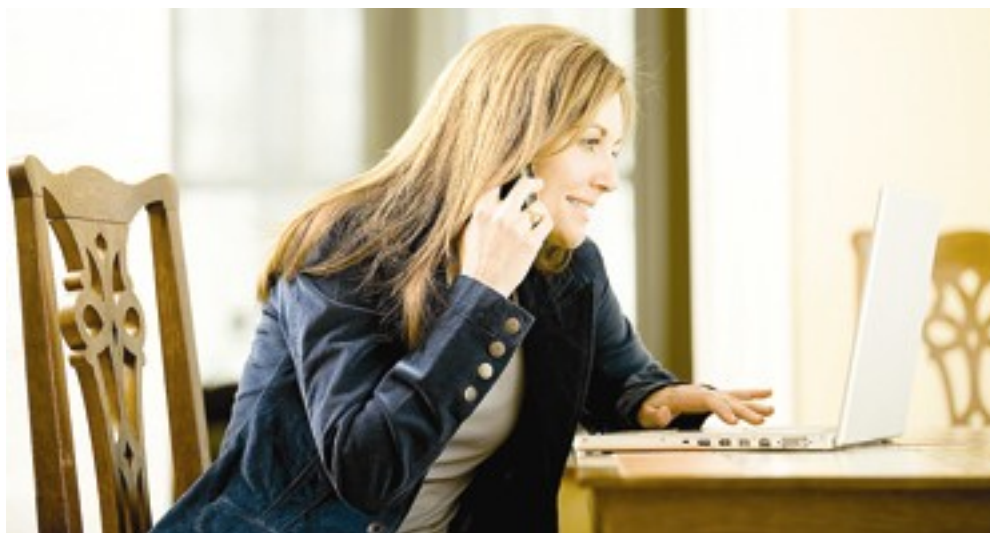
Working in front of a computer often leads to poor posture. Learn how to counteract the effects.

of lower back pain, and stiff necks and shoulders, most of which have a direct correlation to poor posture. If a person sits hunched in front of a computer screen all day, it's likely the head hovers towards the screen, the lower back has collapsed and the tail bone is supporting the weight, and legs are crossed or splayed. Bad standing posture includes the same hunching or lateral