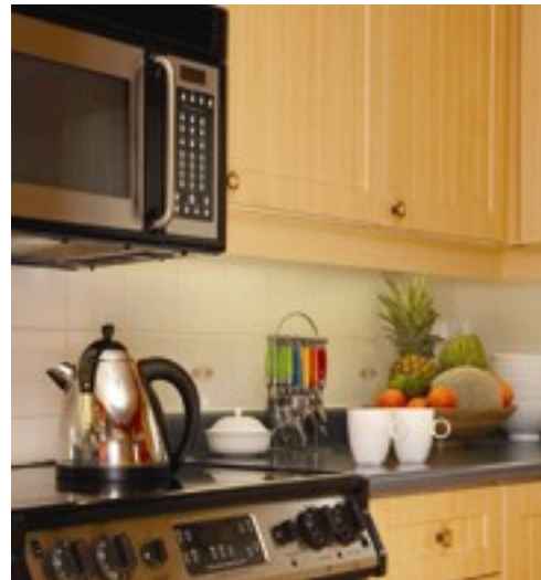
A few simple tips will ensure microwave safety.

Microwave ovens are part of today's cook world and offer certain conveniences --there's little chance of escaping that fact. But by taking a few simple precautions, you can ensure microwave cooking adds to your life--not take away from it.